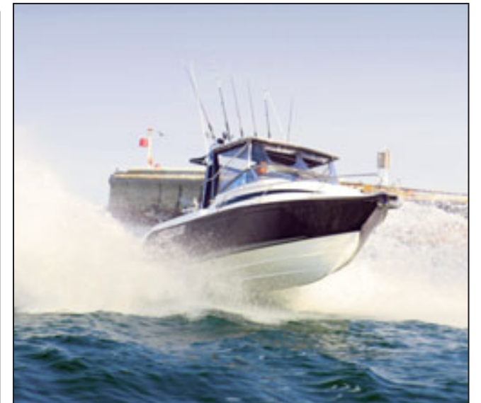
Modern trailer boats (like this Sea Legend SL22) can easily handle surprisingly tough - and rough - conditions that will leave the crew very keen to go home - but the boat will remain largely unaffected.

Now, in writing that, a number of presumptions are made and they include that the boat has been properly prepared for such a dire eventuality, and is capable and seaworthy in extreme conditions. Importantly too, it goes without saying that the skipper of said craft will have the experience and the