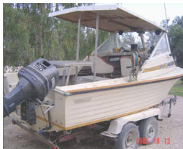
Practical roof and cutting table. Unfortunately only enough room for two people. The old Yamaha was sold and replaced with a later model 175hp.