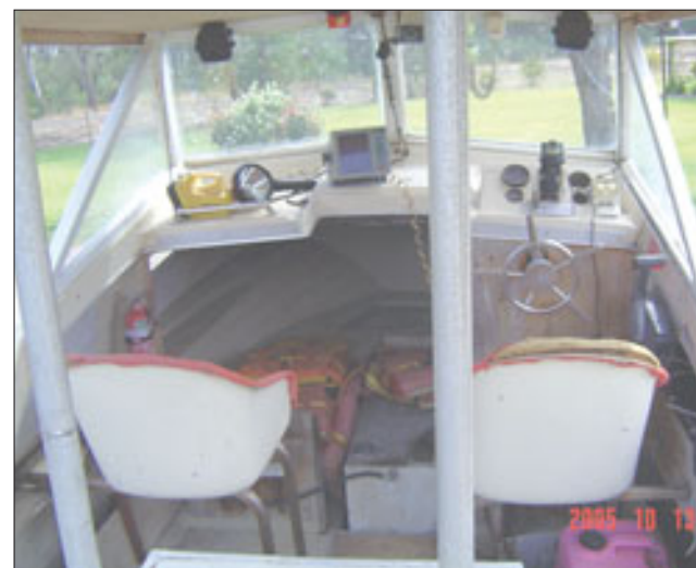
Needs a tidy up.....

I had a saleable product on completion of the project. After looking at a V17L I crossed it off the list as they are small. The V19C are a great sized boat, but prices range from 12-15K for ones that still need work and equipped with aging outboards.