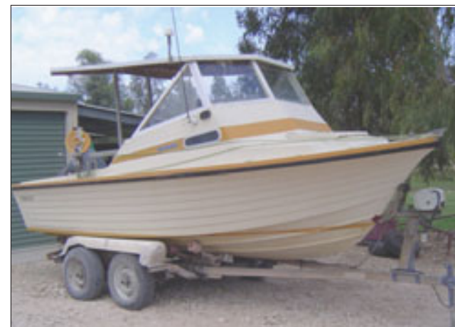
Lovely lines, deep forefoot, solid decks. Held together with cable ties, I think the trailer was lucky to make it home.