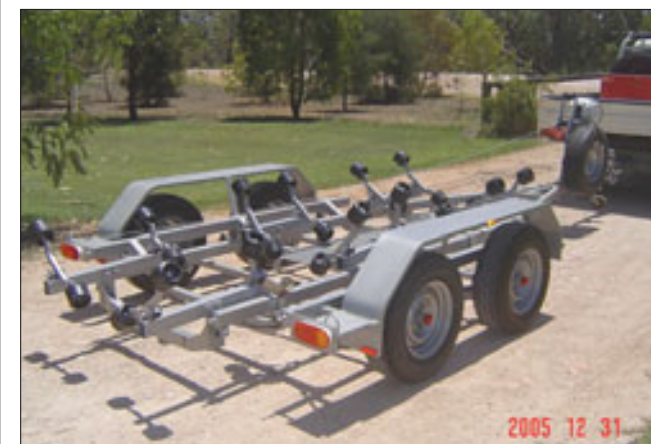
Ready for RWC and Rego

Wiring was concealed to protect from stone damage and LED lights were used. 14" 8 ply light truck tyres were fitted to resist blowouts. A centre walkway was added to help launch and retrieve the rig at the ramp.