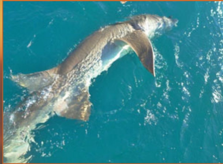
Fun to catch - for a while - on light tackle, the trevally were often a nuisance . . . as were the resident sharks, which came in S,M,L, and XL sizes!