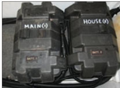
Above: Dual battery boxes installed.