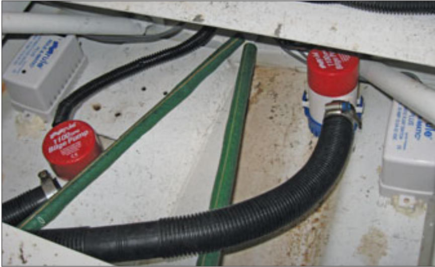
Above: Bilge pump and float switch setup Below: 4-way battery selector switch