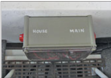
Above: View of battery switch box.