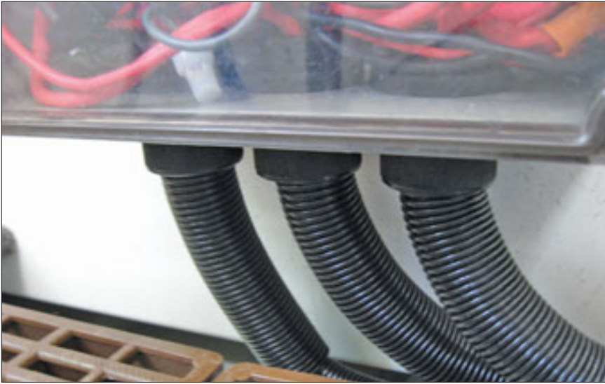
Above: Cable ducting to switch box Below: View of House battery and high current breaker