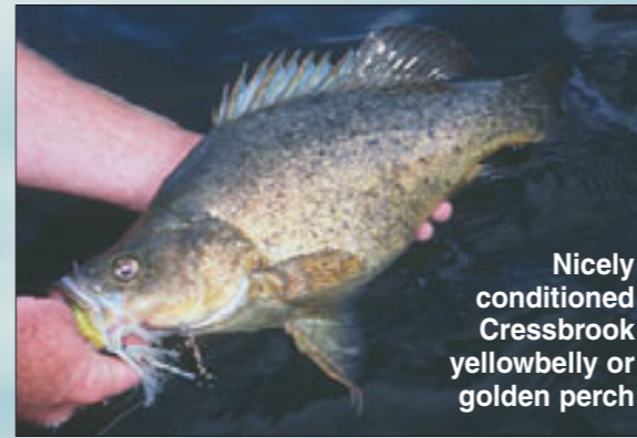
Nicely conditioned Cressbrook yellowbelly or golden perch