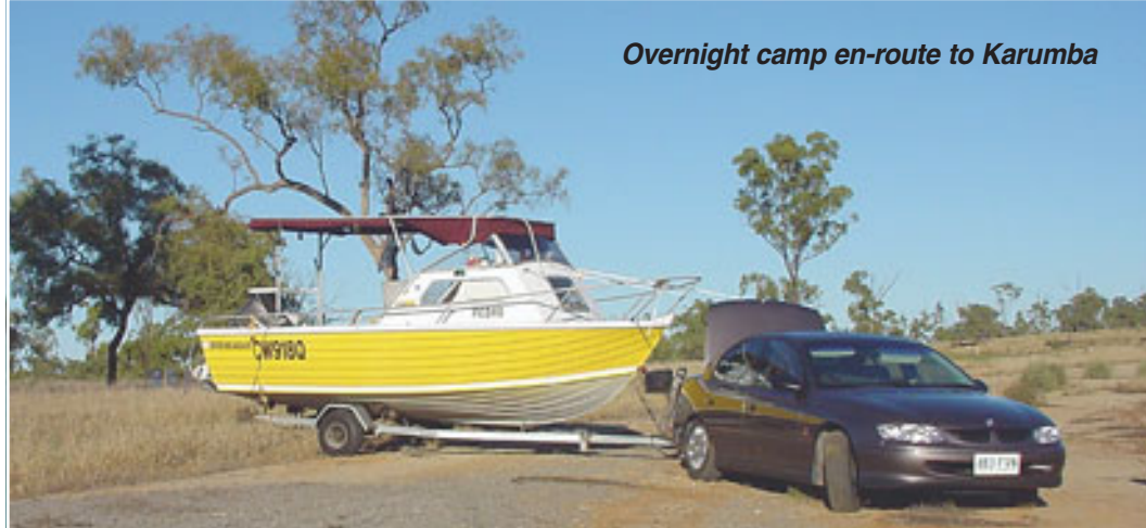
Overnight camp en-route to Karumba