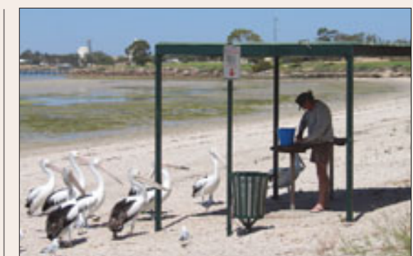
Facing Page: Typical of the coastline along the Great Ocean View Drive Top: Elliston Jetty Above: Cleaning the catch at Streaky Bay Below: John Batty's excellent pic of the Elliston Community Hall mural art.