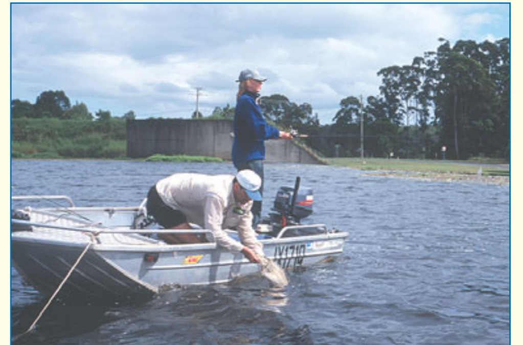
Above: The dam wall (about twenty metres behind us) should be fished with care.

Macdonald is easily accessible to Sunshine Coast