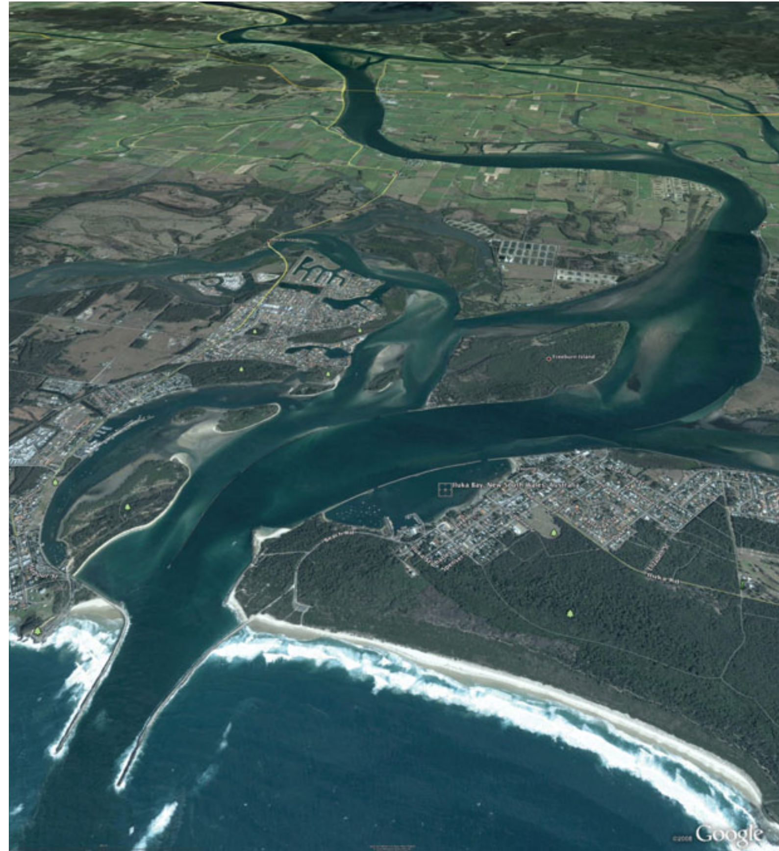
Terrific Google Earth Pro view of the mouth of the mighty Clarence River, and the communities of Yamba (south, or left side of the river in this pic) and Iluka (north side) as the Clarence begins its extremely long navigable run (by Australian standards) way back up to Grafton and beyond. This really is an aquatic paradise for safe family boating, and where the Iluka Riverside Tourist Park (centre behind the walled harbour) is located, is nigh on perfect for fishing families.

There is another concrete ramp, alongside the ferry terminal and boatshed, which is much more suitable for the trailer-boater. It's only