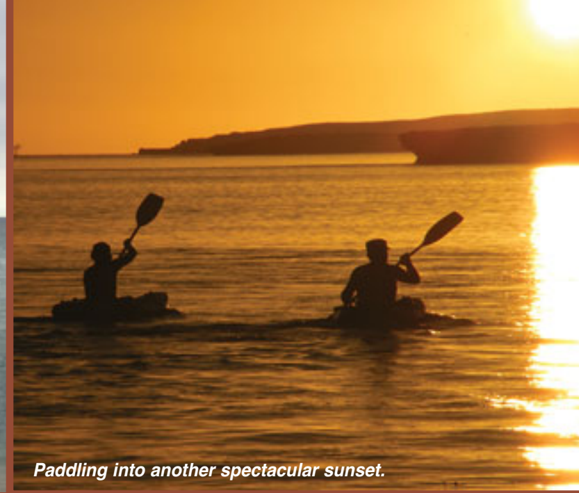
Paddling into another spectacular sunset.