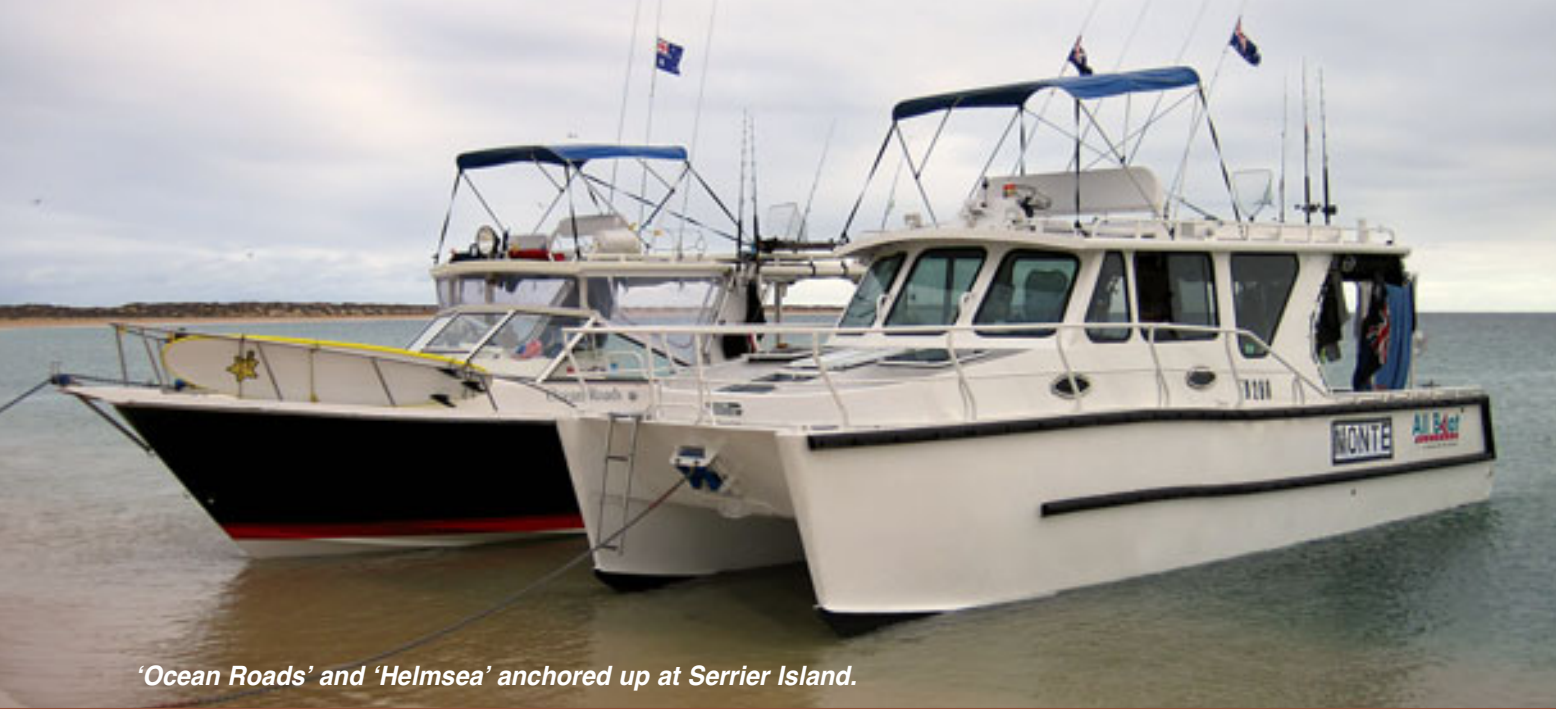
'Ocean Roads' and 'Helmsea' anchored up at Serrier Island.