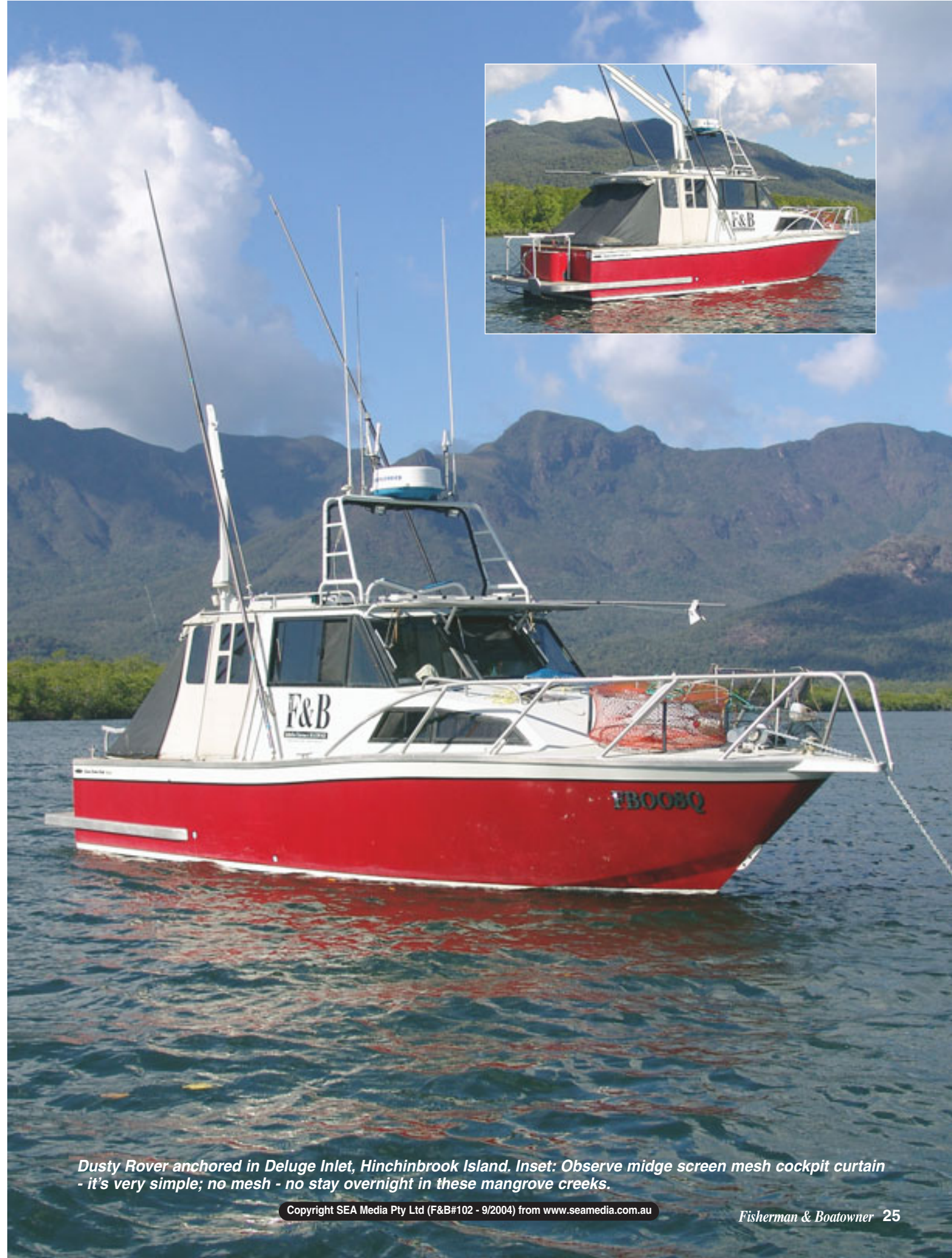
Dusty Rover anchored in Deluge Inlet, Hinchinbrook Island. Inset: Observe midge screen mesh cockpit curtain - it's very simple; no mesh - no stay overnight in these mangrove creeks.

Interstate readers are urged to study their chart of this region carefully before going there for the first