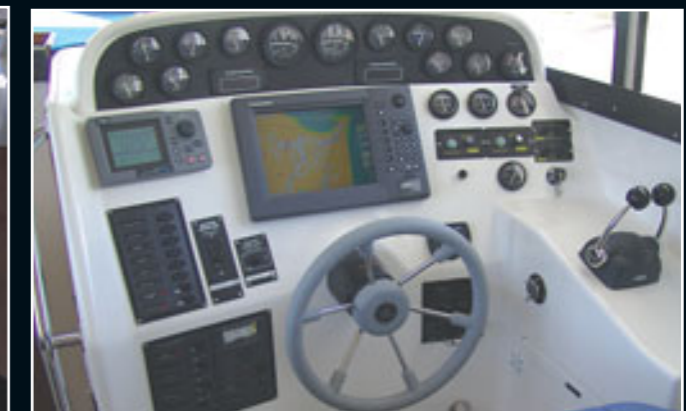
Lower helm is beautifully configured for the skipper.