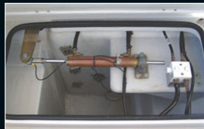
Setting up the steering in a cat this big is not easy. Below: Desalinators are becoming more compact, and user friendly these days.