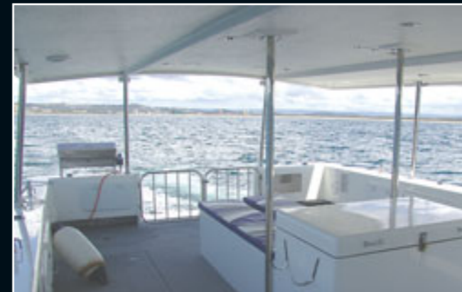
Anyone for tennis? Note terrific freezer chest, and the excellent seating arrangement.