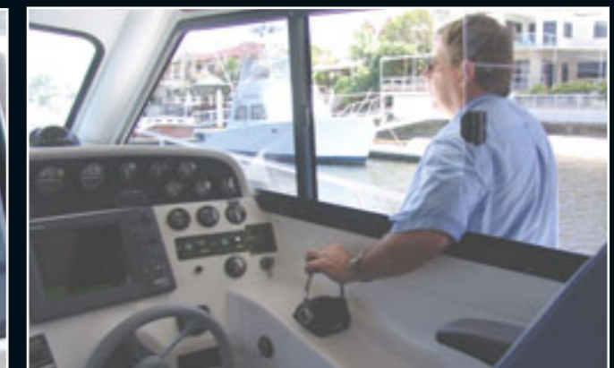
Being a walkaround, coming alongside single handed is easier when you can drive from the outside! Below: Polished dining table is a nice touch.